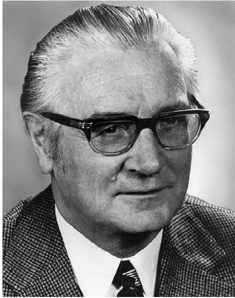
Fig. 1. Konrad Zuse (1910–1995).

machine; it was the first fully operational programmable digital computer in history. Immediately after its completion, Zuse started the design of an upgraded version, the Z4. He had the good luck that toward the end of World War II, both he and the Z4 were evacuated to a safe place in Bavaria, before the Russian army entered Berlin. In 1951, Zuse leased the Z4 to the Technical University of Zurich, where it was in operation until 1953.